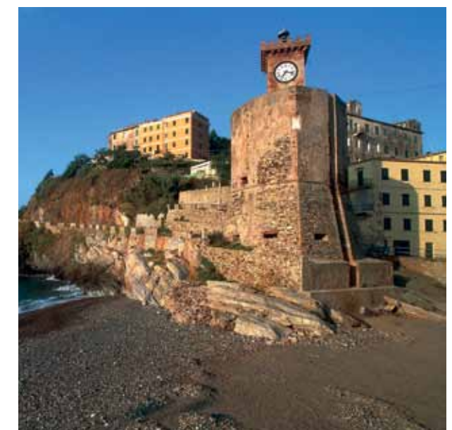
Rio Marina. The tower at the entrance to the Old Port