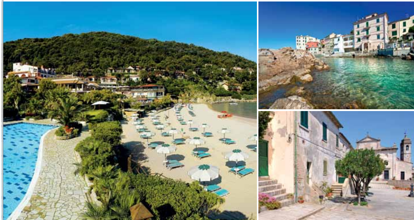
Forno, Scaglieri, Fetovaia, Cavoli, and of course Biodola, one of the best and cleanest beaches on Elba